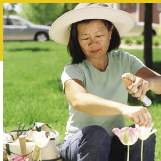
1- 2 hours